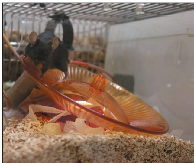
Figure 2. A mouse using a running disc.

Beyond the forms of enrichment described here, we have found other ways that help to improve the welfare of our mice include provision of treats like millet seeds and providing opportunities for exercise by adding running discs to cages (Figure 2.). We have noticed that aged mice provided with running discs looked healthier and more active after two weeks, suggesting that this provision may be important for limiting the welfare impacts of aging. Continuing to trial and evaluate these kinds of interventions are important ways to keep improving the welfare of research animals, even outside of an experimental context. 21